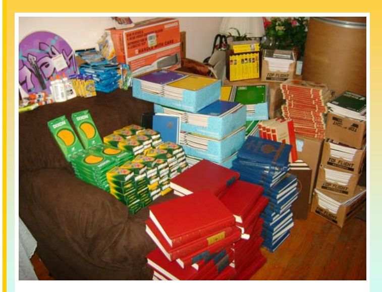
Photo: Wadadli West USA Inc donation of school supplies to the Villa Junior Secondary School which was shipped to Antigua in 2009. We are giving back to our community school.