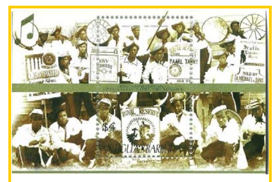
Antigua & Barbuda $4 Stamp portraying a 1949 photo of Hell's Gate Steel Orchestra to commemorate the 50<sup>th</sup> Anniversary of the band

Growing up around Uncle Manning, music was always around me. It was from pan