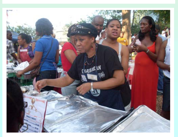
Photo: Wadadli West USA Inc participated in ABCO's Caribbean Splashdown Music Festival and Health Fair on September 5, 2009.