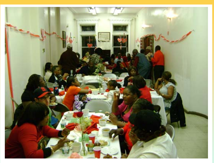
Valentine's Day Tea Party Social on February 14, 2009 was a fun-filled event. Seen here in this photo, our patrons and friends appeared to be savoring the moments of this social outing.