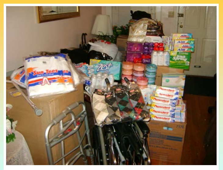
Donation of personal care items to the Fiennes Institute which was shipped in Antigua in 2009. We are caring for the destitute on the Island.