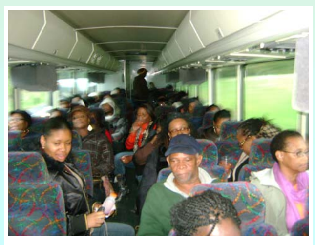
Photo: Wadadli West USA Inc Summer's End Bus Trip to Atlantic City on October 17, 2009, was dubbed a party on wheels with the theme, "Ending Summer in Grand Style"