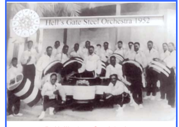
1952 Hell's Gate Steel Orchestra

pan builder and pan tuner until 2005. When considering the influx and usage of foreign pan builders, tuners, arrangers, and even players by the other bands throughout the years, you would